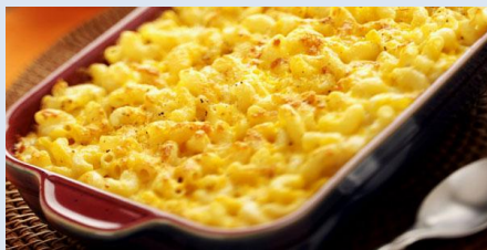
My ultimate four cheese macaroni