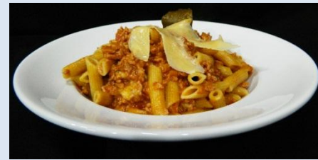
Traditional pork & veal ragu with penne