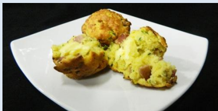
Parmesan topped savoury muffins