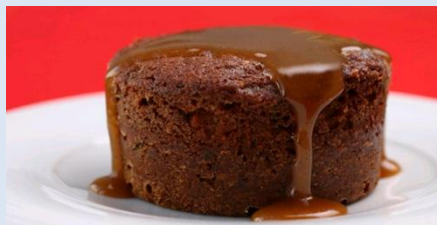
Steamed fresh ginger pudding