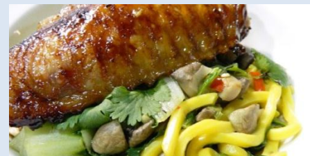
Sticky turkey wings with wok tossed hokkien noodles and vegetables